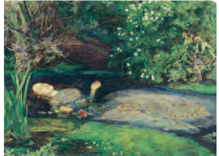
John Everett Millais, Ophelia, 1851-52, oil on canvas, 76.2cm x 111.8cm