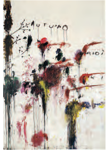
'Autumn' from The Four Seasons, Cy Twombly, 1993-5

Cy Twombly was one of the most influential artists of the 20th century - his canvases were often inspired by ancient myths or classical European literature and include painting, drawing, writing, poetry and images. In the 1950s at the time when abstract painting dominated the New York art scene he left America to live in Rome.