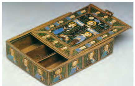
Box reliquary of the True Cross, silver gold and enamel, Byzantine, 800AD, © Metropolitan Museum of art, New York