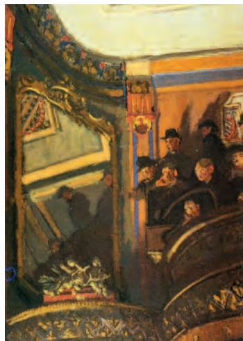
Walter Sickert, Gallery of the Old Bedford Music Hall , 1890s, oil on canvas, 127 x 77.5cm, ©National Gallery of Canada,

The Camden Town Group of painters, led by Walter Sickert, chronicled the changes in British society, and particularly in London, in the years before and during the First World War. They saw themselves as 'painters of modern life' depicting many of the challenges to the values of the nineteenth century. They painted portraits of working-class subjects and created images of women as explicit as anything being produced in Europe at the time. These works are recognisable for their use of bold anti-naturalistic colouring and noted for their striking images of the music hall which provide an invaluable record of the leisure pursuits of the Edwardian age. The Camden town Group had only a brief life, holding just three exhibitions, in June and December 1911 and December 1912, although the individual members worked on.