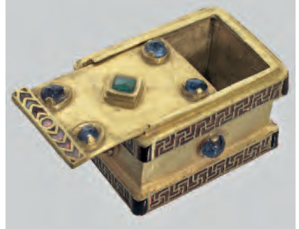
Reliquary Box, gold with garnets and precious stones, 350 – 450AD, ©Varna Archaeological Museum, Bulgaria,